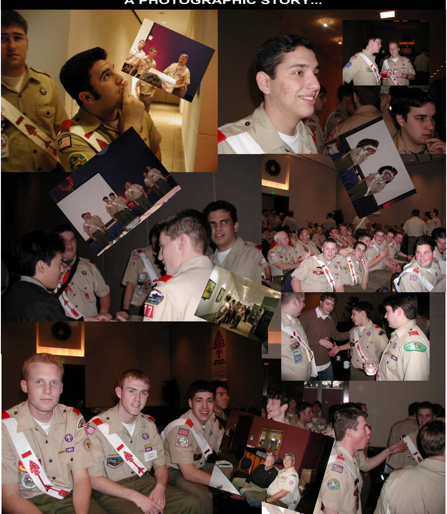
"HE WHO SERVES HIS FELLOWS, IS, OF ALL HIS FELLOWS, GREATEST"