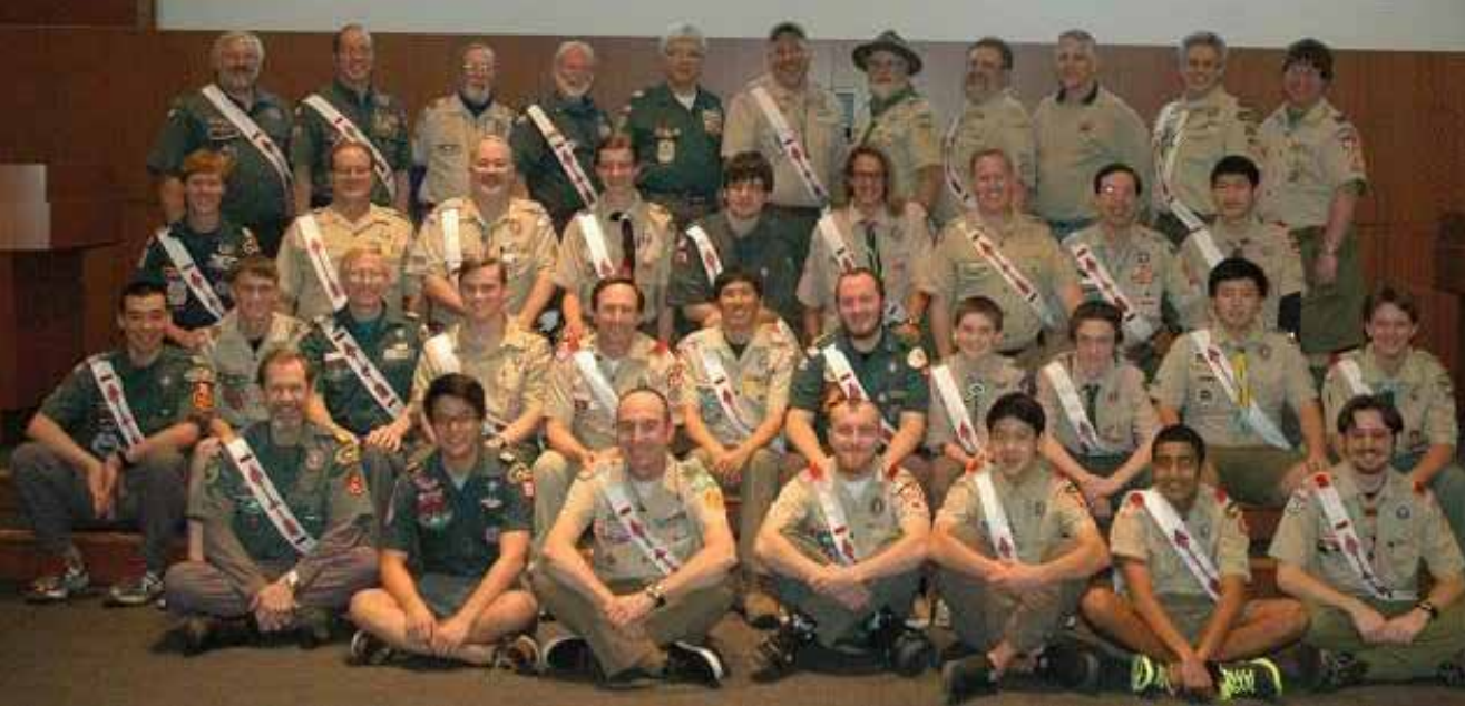
UNITED Attendees of the first Esselen-Miwok merger meeting