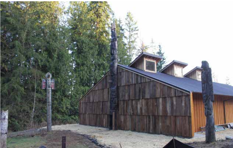
T’Kope The lodge’s new longhouse completed in 2013

In April of 2013, this dream was realized. On the same site as the original, a new longhouse now stands proudly, ready to be used by it’s lodge. T’Kope Kwiskwis was able to build