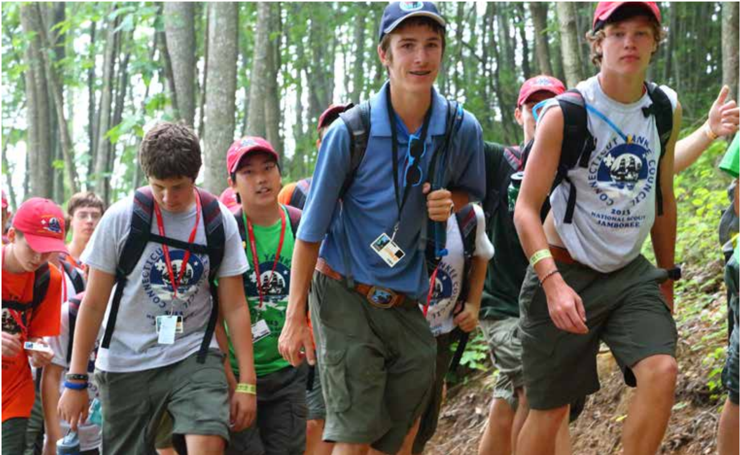
PROJECT 2013 | Page 4 LEADING THE WAY An OA Trek Guide leads scouts to Garden Ground Mountain at Bechtel Summit

Through wind, rain, and sometimes even sunshine, thousands of scouts volunteered to go the distance and provide service to the communities of West Virginia during their day of