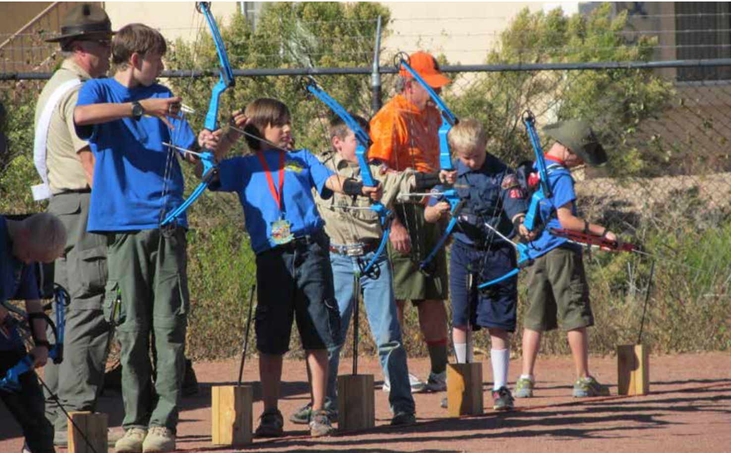
INSPIRING THE FUTURE Arizona Cub Scouts try their skills at archery during Conclave

Arrowmen at the 2013 Conclave had a great time and enjoyed participating in all the fun activities. Training, carnival games, Powwow, Cub Scouts, the dunk tank, and much more were in the spotlight at Conclave. Many out-of-section guests were also in attendance, representing more than eight sections from around the country. 2014 poses another great opportunity for Section W-6W to be innovative and creative in its Conclave program. The 2014 conclave season will kick off next April. Make sure you check out your own section's conclave!